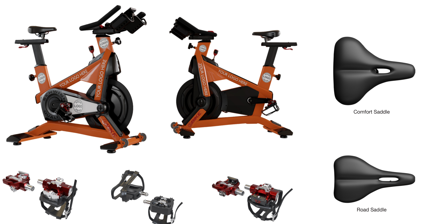
Morse Taper Triple Link™ Keo-compatible pedals