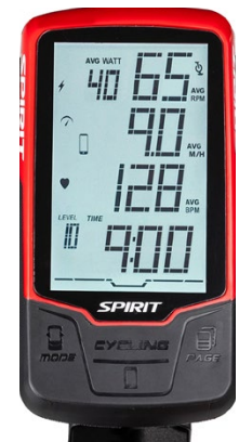
Wireless LCD Console with Bluetooth FTMS